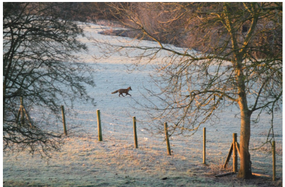
Early morning fox