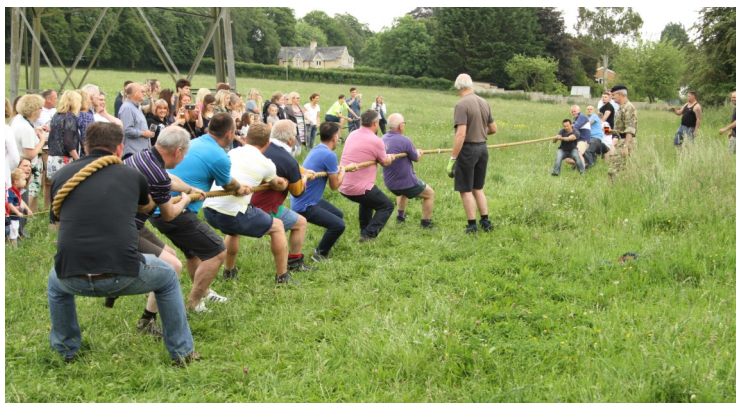
Teams 'East' and 'West' (of the White Horse) competing