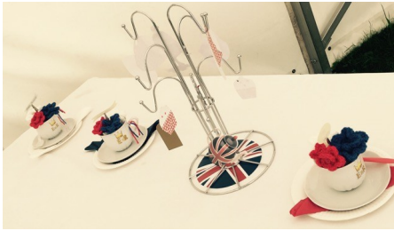
Elizabeth's table decoration

with friends and neighbours and feeling glad to live somewhere with real community spirit.