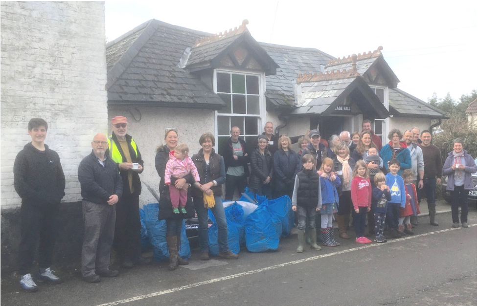
Some of the litter pickers outside the village hall after well-earned refreshment