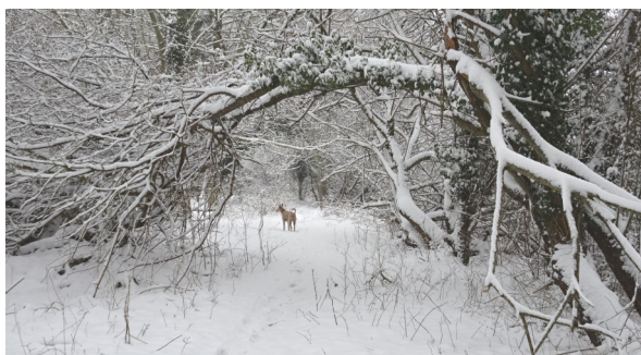
Photo of his dog in Boyes wood

These words from a Thomas Hardy poem describe the scene so well.