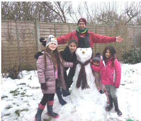
Kinnell family snowman

Do let your neighbours know if you weren't offered help and would like someone to check on you next time.